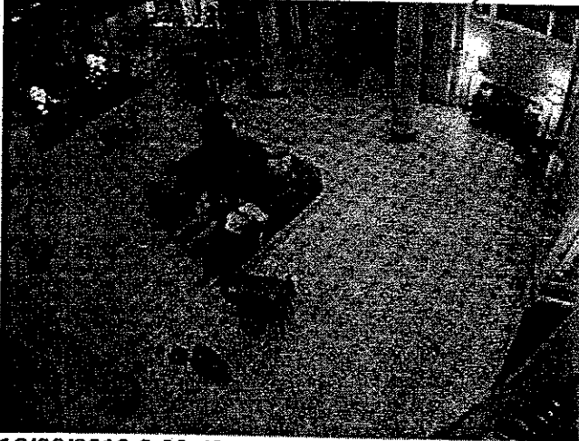
Mr. Wekerle and female on the sofa in the lobby Front Lobby Area at Capital Hotel Lobby